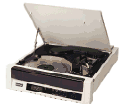
Typical 3418 drive

When we look back over 15 years and look at technology changes, although there are significant developments and it appears to change so fast, products we find we're still working on are 9 track and 3480/90E drives. Both have a history far longer than 15 years as we worked on 9 track drives in my case from my first job back in 1973. We've defaulted down to almost the smallest drives i.e. Qualstar 9 track & Fujitsu 3490E, although no longer manufactured they're still in fairly regular supply and in constant use at transcription centres. It's encouraging to say it's thanks to such strong technologies that we retain engineering abilities enabling us to have the depth of knowledge required when working on the latest technologies. The 9 track drives wins a place in our hearts as the longest surviving storage technology and one which we've worked upon continuously from 1993 to the present. Thank you IBM, lets hope that R & D continues to find the investment and interest to produce such technologies well into the future.