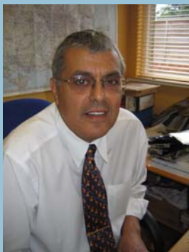
Reed, with a few more wrinkles than when he first joined!